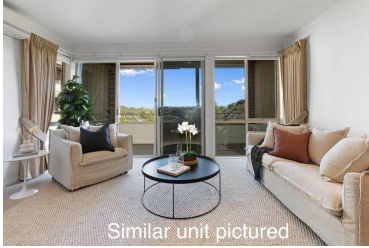
Similar unit pictured

Section 47AF of the Estate Agents Act 1980