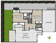
4/36 BRUCE ST FAWKNER

Section 47AF of the Estate Agents Act 1980