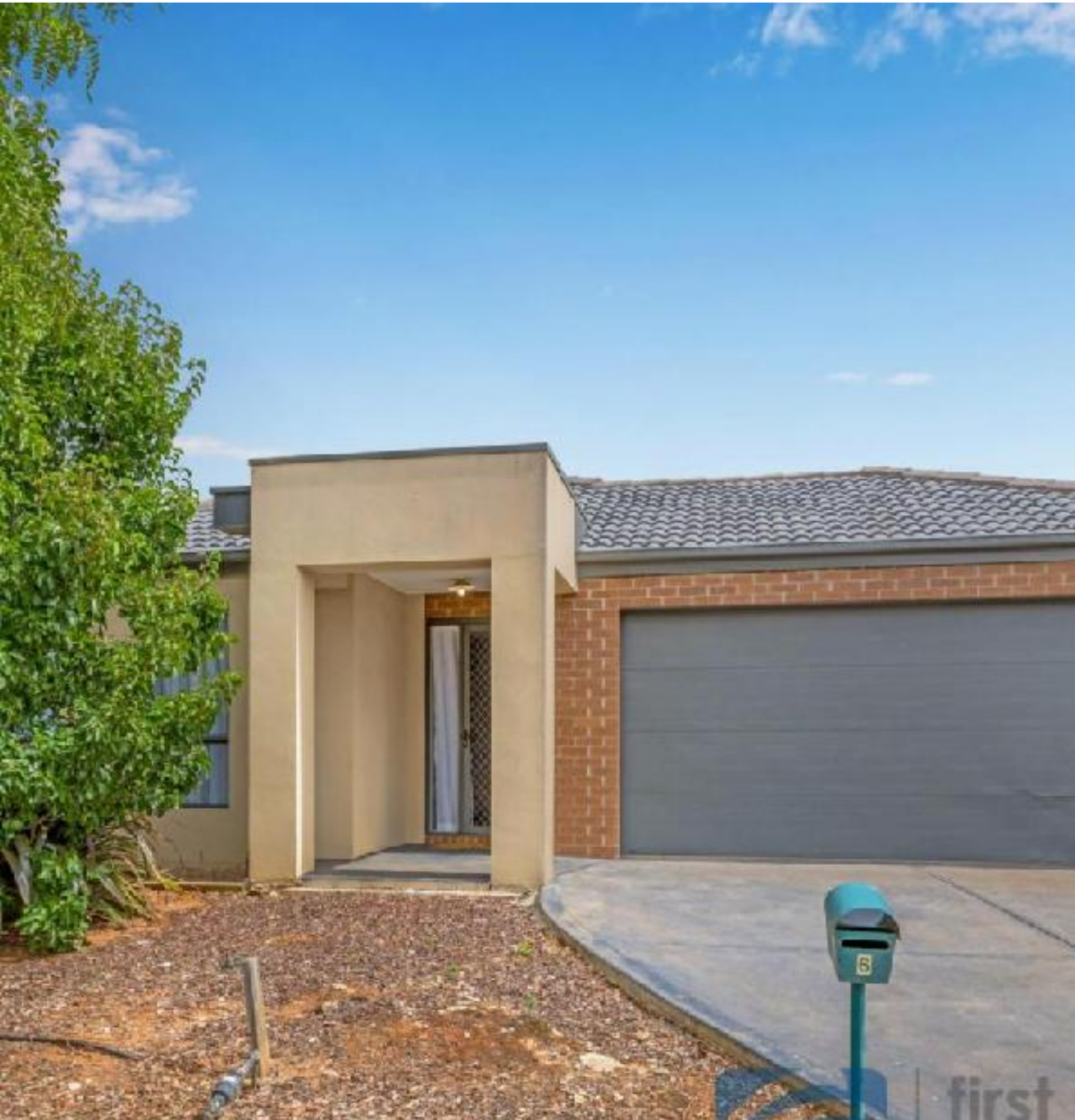
6 PITTOS AVENUE, BROOKFIELD, VIC 3338 PREPARED BY MITCH (HUNG) NGUYEN, PROFESSIONALS ST ALBANS